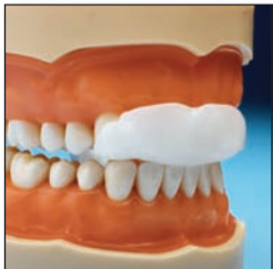
Anterior bruxing appliance