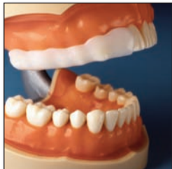
Insulate sensitive teeth